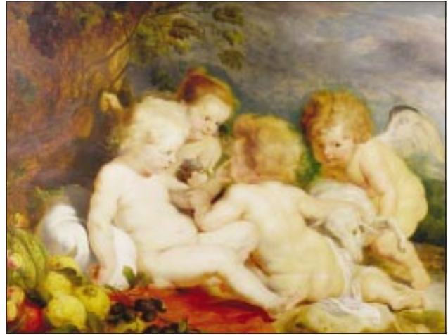
The group learning process: acquiring desirable learning skills

Students elect a chair for each PBL scenario and a “scribe” to record the discussion. The roles are rotated for each scenario. Suitable flip charts or a whiteboard should be used for