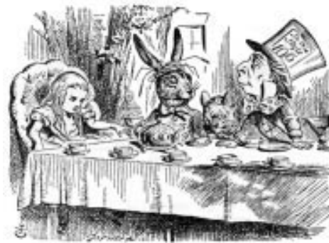
A dysfunctional group: a dominant character may make it difficult for other students to be heard